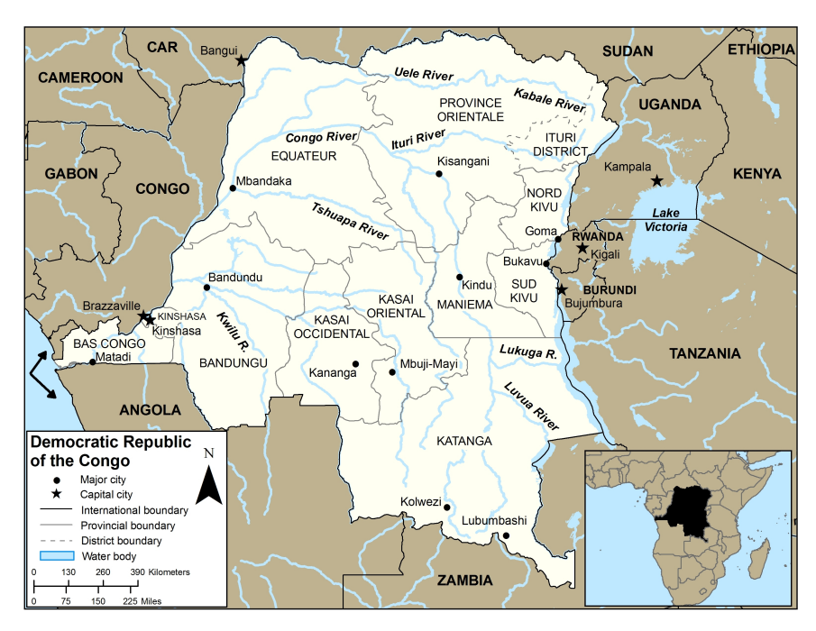
Note : The DRC Constitution, which was ratified in 2005 and came into effect in 2006, mandates that within three years the eleven provinces be redivided into twenty-six. As of June 2011, the redivision had not yet taken place.

move the country forward. Second, because of complex historical and cultural factors, the DRC is currently suffering from an epidemic of sexual and gender-based violence (SGBV), which includes not only rape, but also precocious marriage and forced prostitution. During the war, rape was used as a weapon, but the practice did not end with the war. The legacy of SGBV is being perpetuated in ASM communities; it therefore makes sense, from a practical perspective, to emphasize the prevention and reduction of SGBV in those communities.